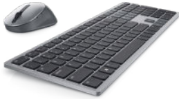
DELL PREMIER MULTI-DEVICE WIRELESS KEYBOARD AND MOUSE – KM7321W

Multi-task seamlessly across 3 devices with this premium full-sized keyboard and sculpted mouse combo with programmable shortcuts and 36 months battery life. 7