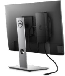
DELL DOCKING STATION MOUNTING KIT – MK15

Experience true color and striking clarity on this 27" 4K monitor with a wide color coverage. This VESA DisplayHDR™ 400 monitor features virtually borderless InfinityEdge and USB-C connectivity with up to 90W power delivery.