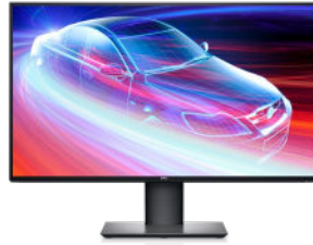
DELL ULTRASHARP 27 4K USB-C MONITOR – U2720Q

Multi-task seamlessly across 3 devices with this premium full-sized keyboard and sculpted mouse combo with programmable shortcuts and 36 months battery life. 7